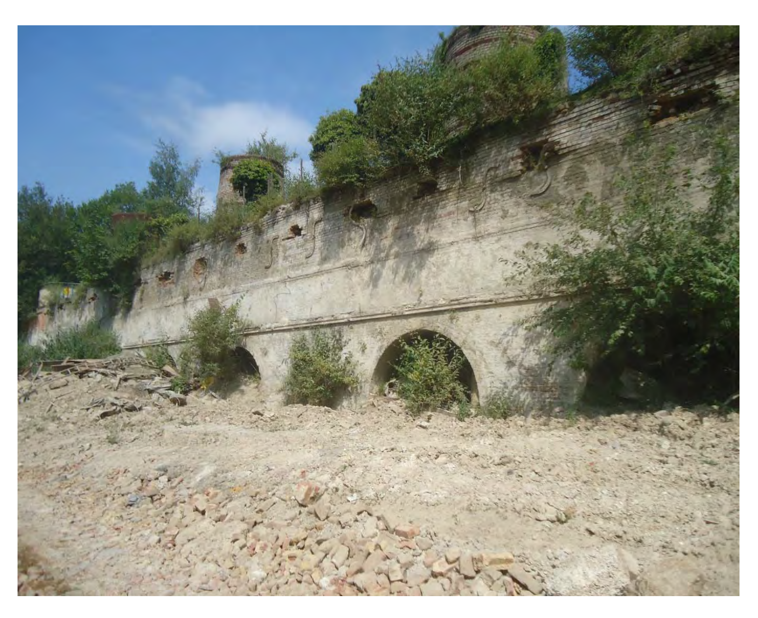
Figure 11 :- Old Lime Kilns