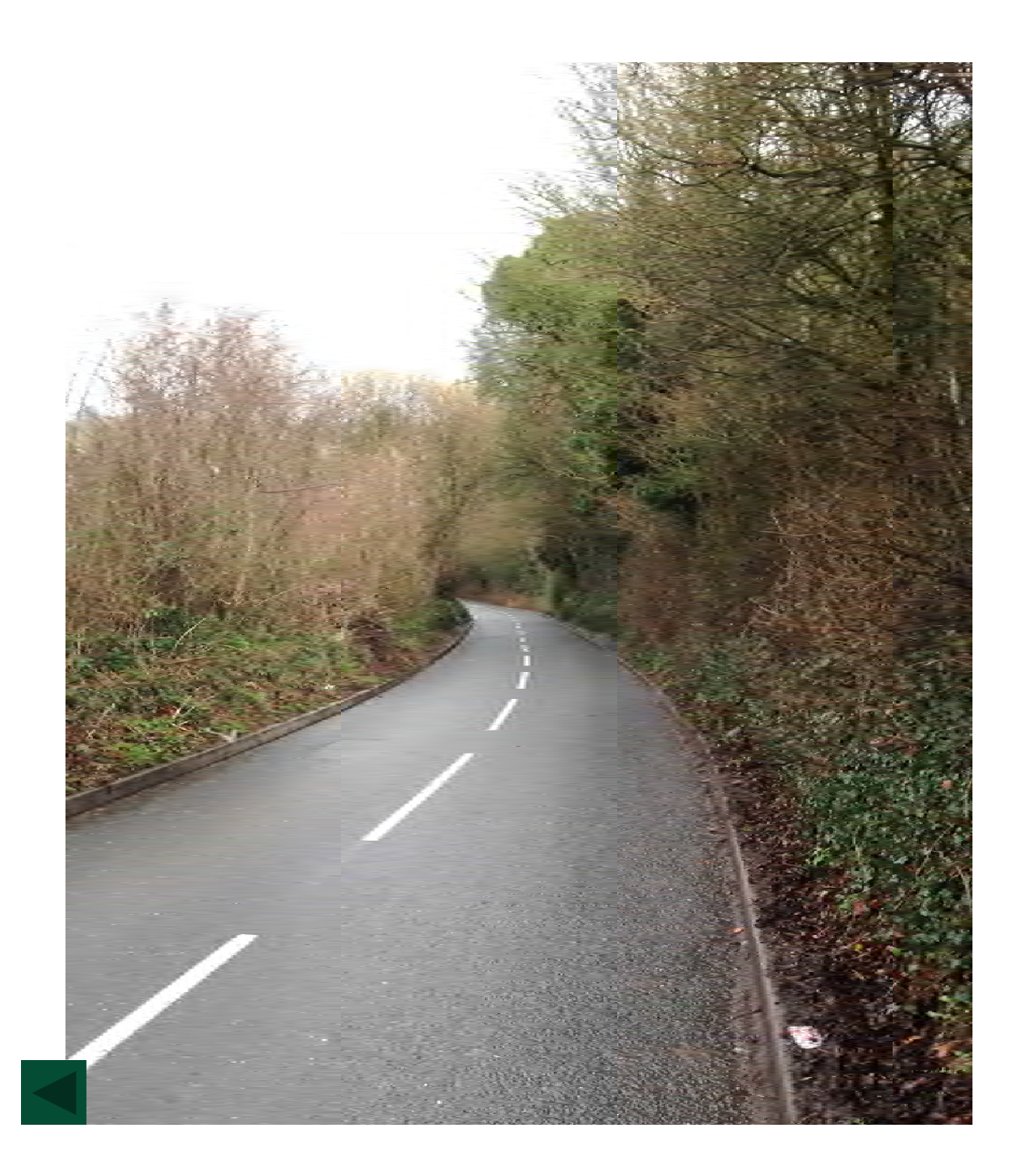
Figure 17: Upper part of Chalkpit Lane, looking northwards, just before application site