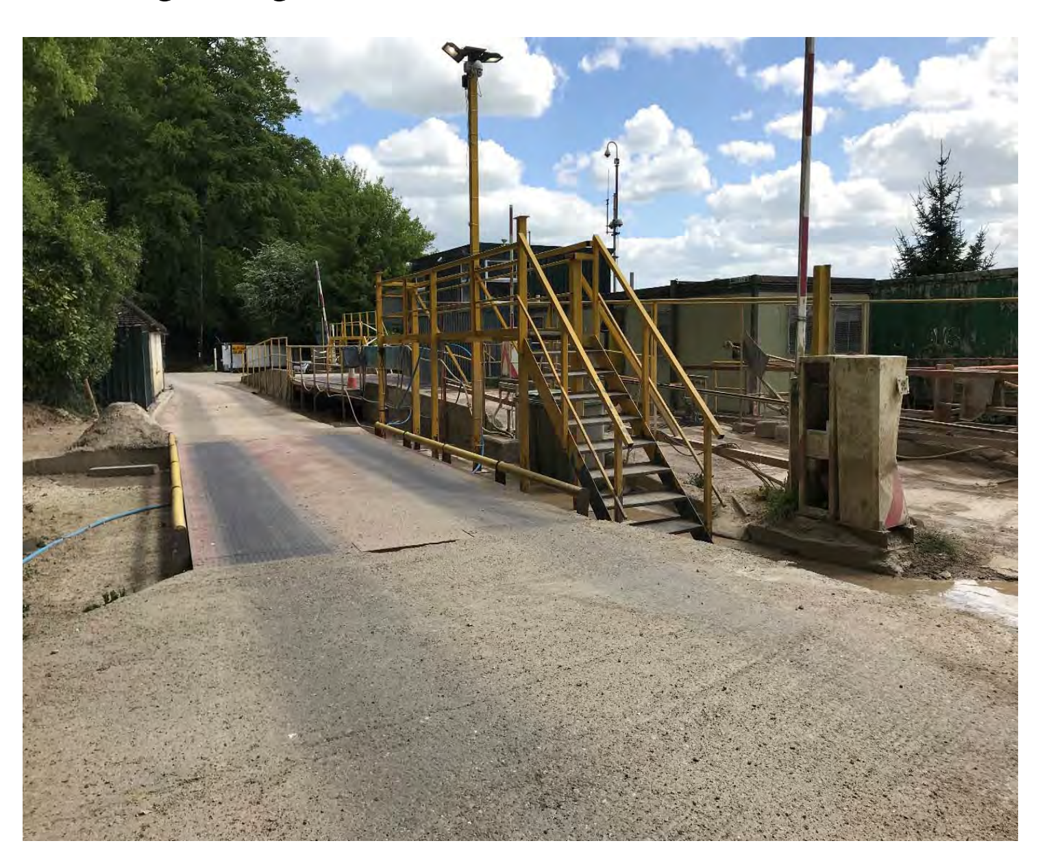
Figure 3:- Weighbridge and Site office