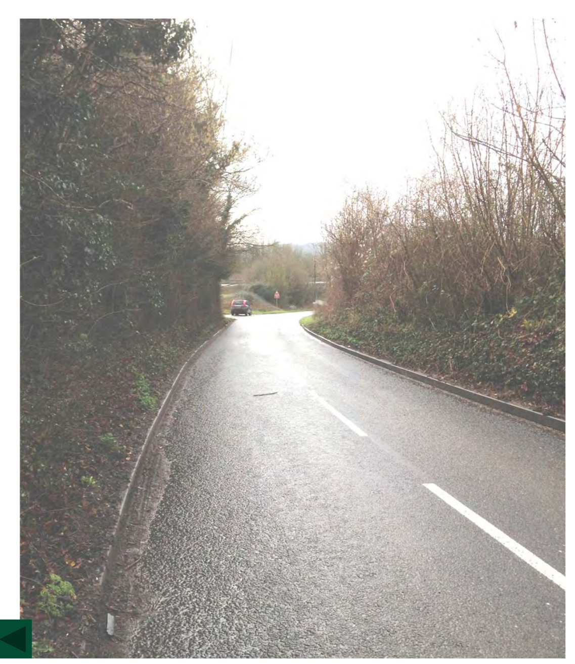
Figure 18: upper part of Chalkpit Lane looking southwards towards the M25